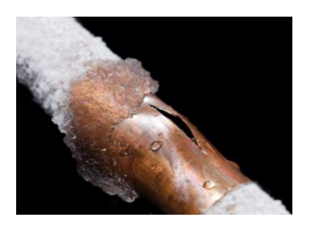
A frozen pipe could burst and become a costly inconvenience.

If there is no water coming into your home , call BWSC's 24-hour Emergency Assistance Line at 617-989-7000.