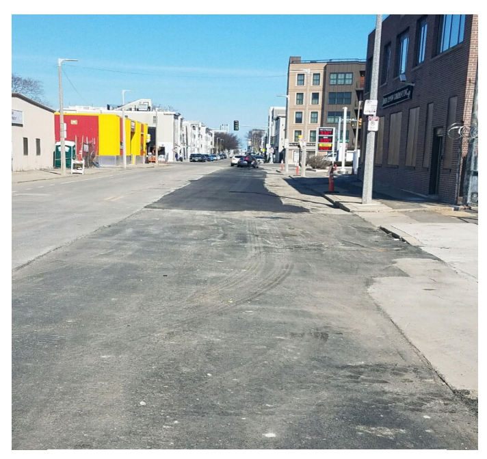
Temporary paved sewer trench on D Street from Dot Ave towards Old Colony Street.