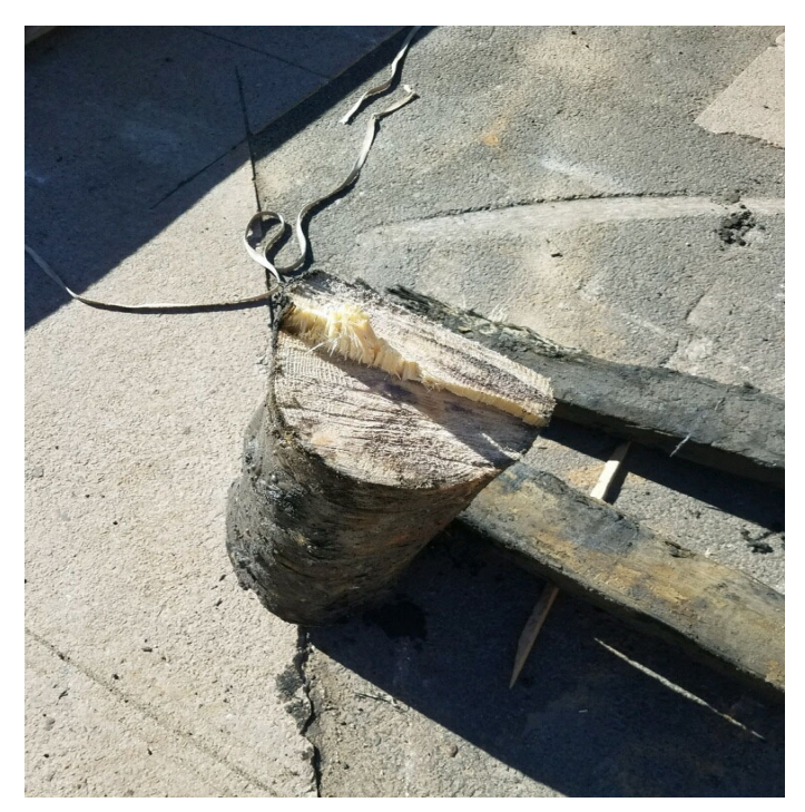
Sample condition of existing wood pile from D Street.

The contractor will continue sewer installation work on D Street from Old Colony Avenue towards West Seventh Street. Additionally, a second crew will remobilize to Baxter Street and install water main from C Street towards E Street, and continue water main installation on Middle Street from Dorchester Avenue towards Dorchester Street and storm drain and watermain in Woodward Street from Dorchester Avenue to Glover Court.