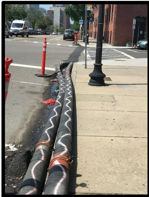
Typical Water Main Bypass Albany Street