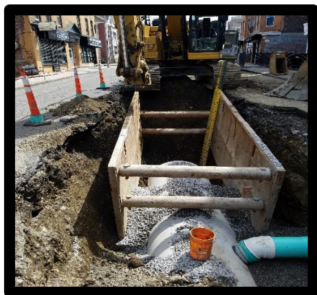
Dudley Street Installation of 48" Drain Pipe

*Permanent Paving of Mount Pleasant Ave and Forest Street to commence this month.