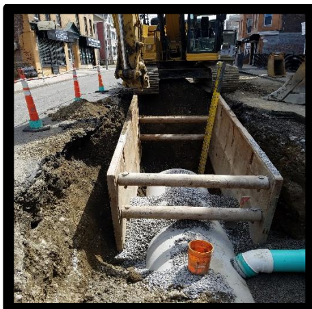
Dudley Street Installation of 48" Drain Pipe

Construction Contacts: For additional information contact.