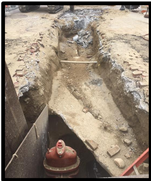
Utility Conflicts During Water Main Installation Cross Street