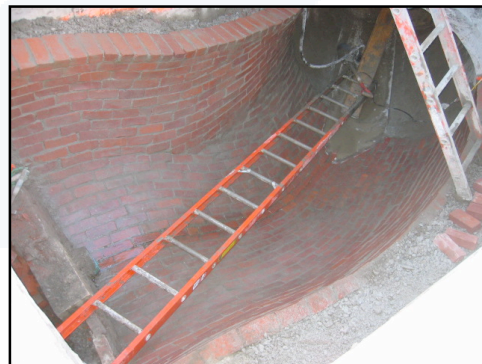
New brick invert in Manhole D between new 66" storm drain and existing tidegate structure in Farragut Rd.

If you have any questions or concerns during the project, please let us know.