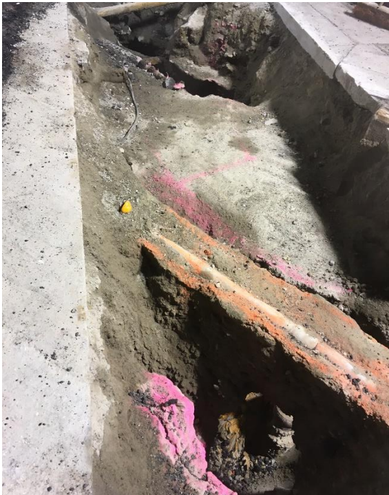
Sewer Replacement Excavation