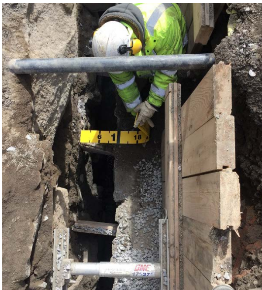
Phase II Trench w/ Electric Duct Constraint

Note: Progress of sewer replacement significantly impacted by difficulty in locating existing sewer due to an unknown electric duct bank directly above proposed sewer alignment and unforeseen encounter of granite block foundations that extend further out towards the roadway than shown on record drawings. These conditions have impacted the construction schedule.