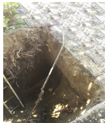
BWSC replaces lead lines through the Lead Incentive Replacement Program.

Students and teachers are gearing up for another adventurous school year. BWSC's educational staff provides year-round, interactive presentations for students of all ages. The program is part of our outreach to schools interested in learning more about how Boston's water, sewer, and storm water systems work.