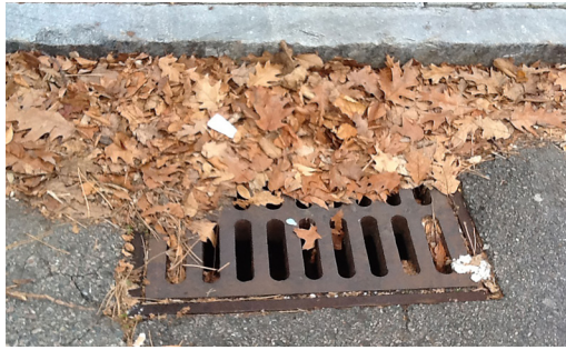
Keeping catch basins clear of leaves and debris lets water flow through Boston's storm drain system.

To prevent local flooding Boston Water and Sewer Commission and the Department of Public Works perform year round maintenance to keep catch basins clean and free of debris, but there are ways Boston residents can help too. All that's needed is a rake, shovel, broom and receptacle.