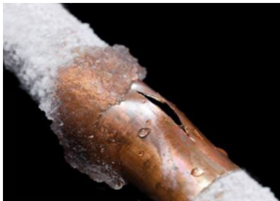
A frozen pipe could burst and become a costly inconvenience.

If there is no water coming into your home , call BWSC's 24-hour Emergency Assistance Line at 617-989-7000.