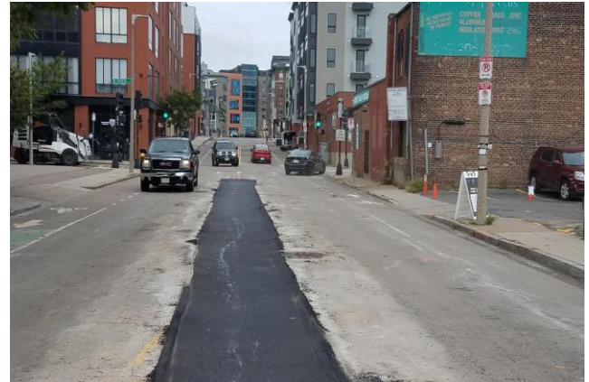
Completed sewer from Gold Street to A Street.