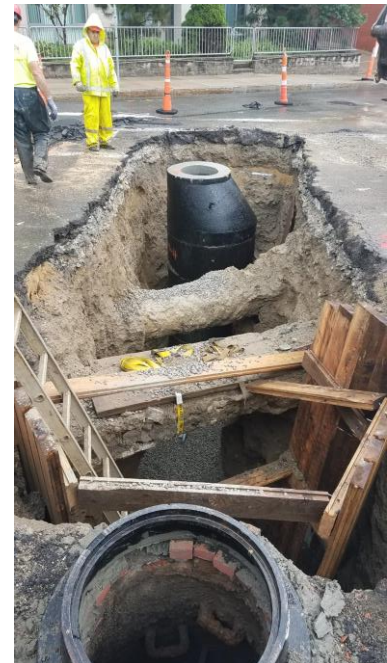
Installation of sewer manhole on Dorchester Ave. at West Fourth St.