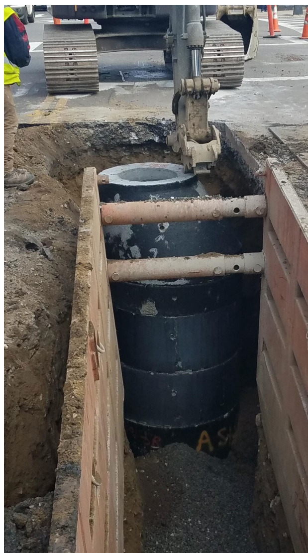
New drain manhole installed at A Street near Broadway.