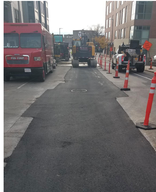
Temporary pavement on A Street.

Work on Silver Street will be performed in two sections, from A Street to the South Boston Bypass Road and from Dorchester Avenue to A Street. Work will commence in the beginning of December and continue over the next three weeks, weather permitting.