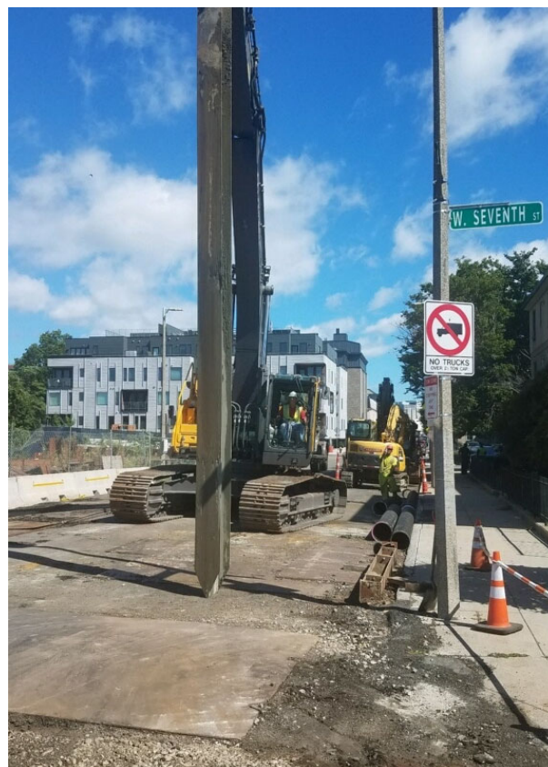
Pile Removal at Special Manhole A on West Seventh Street