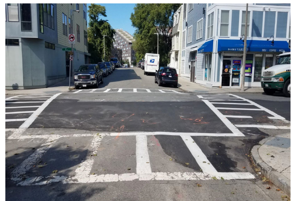
Temporary Paving on B Street at Crowley Rogers Way