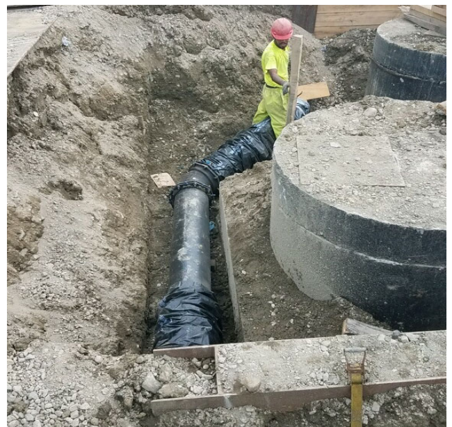
12-inch Watermain Installation at B Street and West Seventh Street