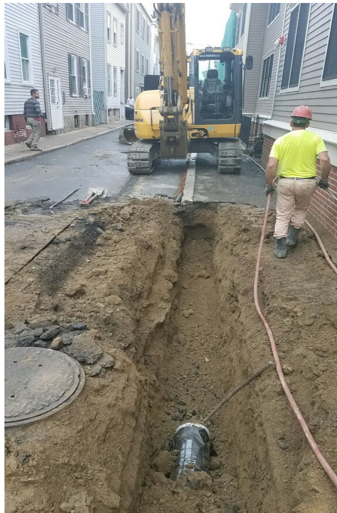
8-inch Watermain Installation Athens Street