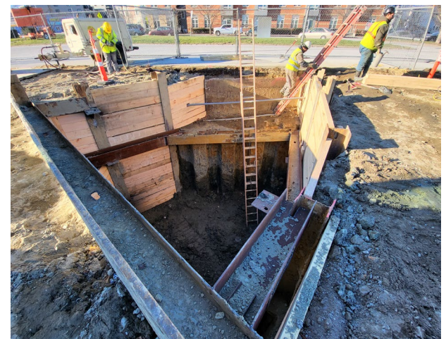
Excavation in Moakley Park