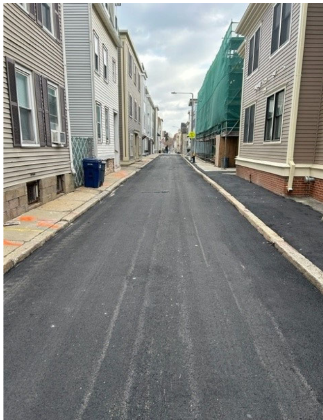
Temporary Paving Athens Street

Incidents reported this period 0 Incidents reported to-date 0