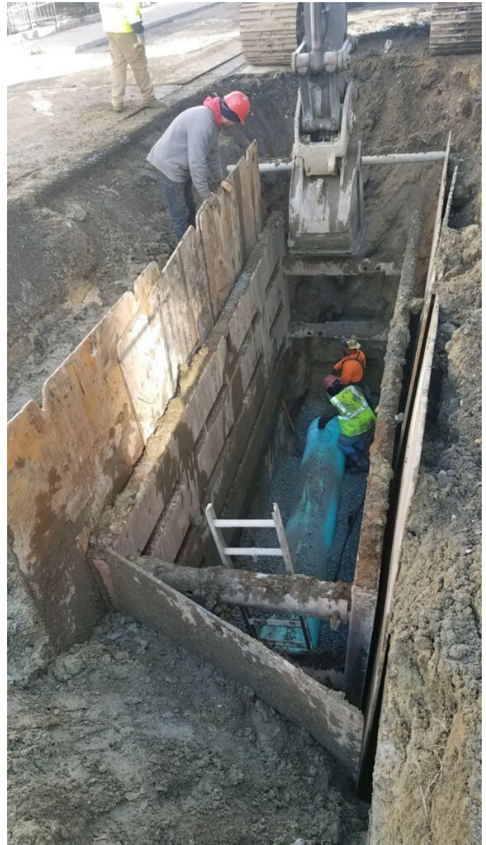
24" sewer installation on Flaherty Way.

Currently, the contractor plans on continuing work with one crew within BHA property with a focus on sewer and drain installation on Flaherty Way from B Street towards D Street.