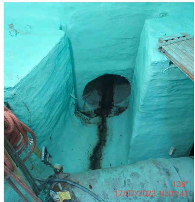
Completed spray-on liner and epoxy coating in Manhole C.