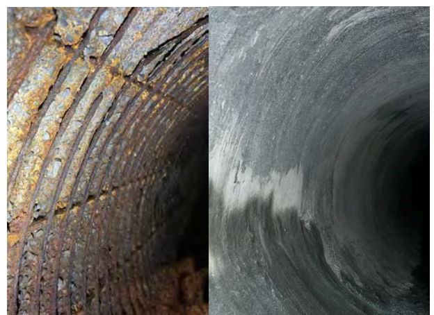
Before/after rehabilitating 36" connector pipe between Manhole C and D with spray-on liner.