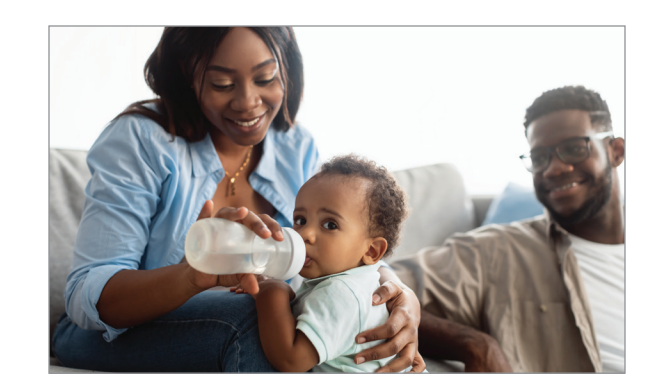
Health Effects of Lead

Exposure to lead in drinking water can cause serious health effects in all age groups. Infants and children can have decreases in IQ and attention span. Lead exposure can lead to new learning and behavior problems or exacerbate existing learning and behavior problems. The children of women who are exposed to lead before or during pregnancy can have increased risk of these adverse health effects. Adults can have increased risks of heart disease, high blood pressure, kidney or nervous system problems.