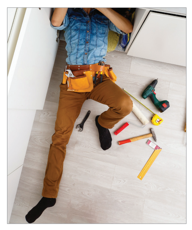
Other Options Consumers Can Take to Reduce Exposure