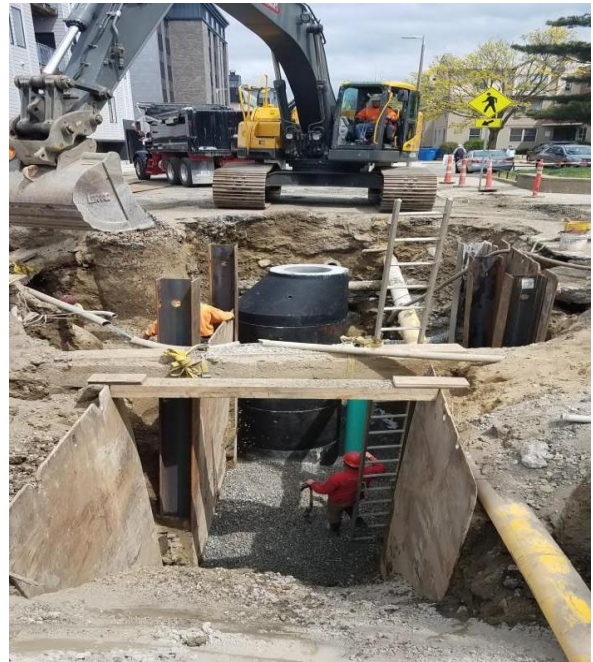
Typical Sewer Separation Project