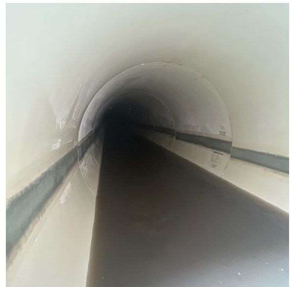
Slipline pipe installation is complete in the 102" NBMI.