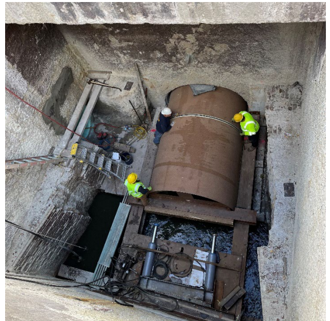
Crews inspect a slipline pipe joint during jacking.