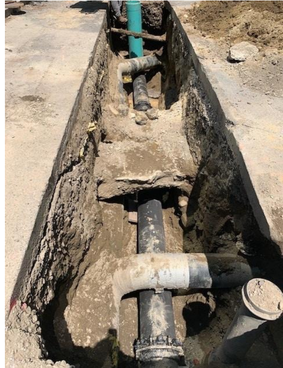
Typical Water Main Trench

Temporary restoration of roadways, sidewalks and other areas disturbed by construction will be completed under this contract. Permanent paving restoration will occur under a separate contract.