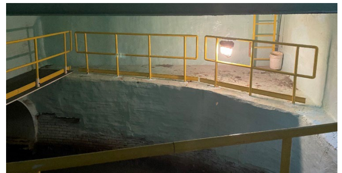
Special Manhole A