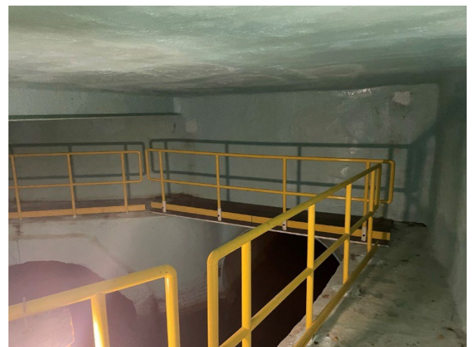
Special Manhole A

Contact us at: Project Field Office Voicemail: 617-865-9299 (daytime) or 617-989-7900 (24/7 emergency) Email: nbmi@bwsc.org