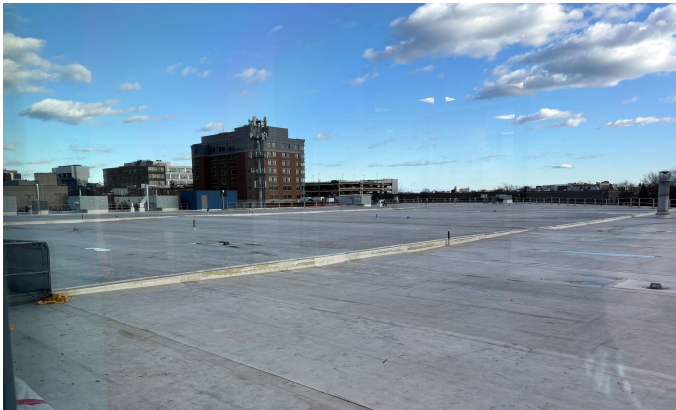
Phase D New Roof and MAU's

The project entails replacement of the roof on the parking garage and the headquarters, upgrades to several structural beams within the ceiling on the third floor, replacement of the twelve (12) rooftop Air Handler Units, seven (7) Make-up Air Units and several exhaust fans. Construction cost is $21,188,886.00 Phase I and $4,215,287.00 for Phase II.