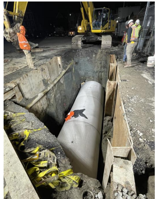
72" Storm drain installation in Eagle Square

The contractor will continue installation of water, sewer and drain mainlines on East Eagle Street. The contractor will continue installation of sewer mainline and manholes on Frankfort Street as well as new drainage infiltration structures. The Contractor will begin installation of new a water main on Frankfort Street, Swift Street and Swift Terrace. The Contractor will also begin performing cured in place pipe (CIPP) lining on Falcon Street, Condor Street, Glendon Street, Trenton Street, Prescott Street, Lexington Street, Bennington Street, Bremen Street and Saratoga Street.